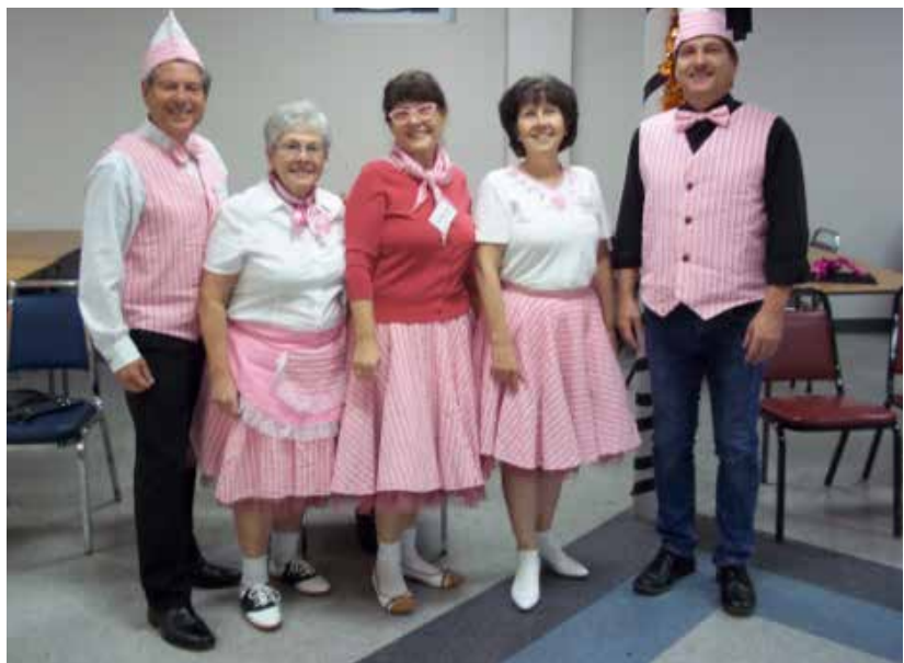
OUR OWN DINER STAFF