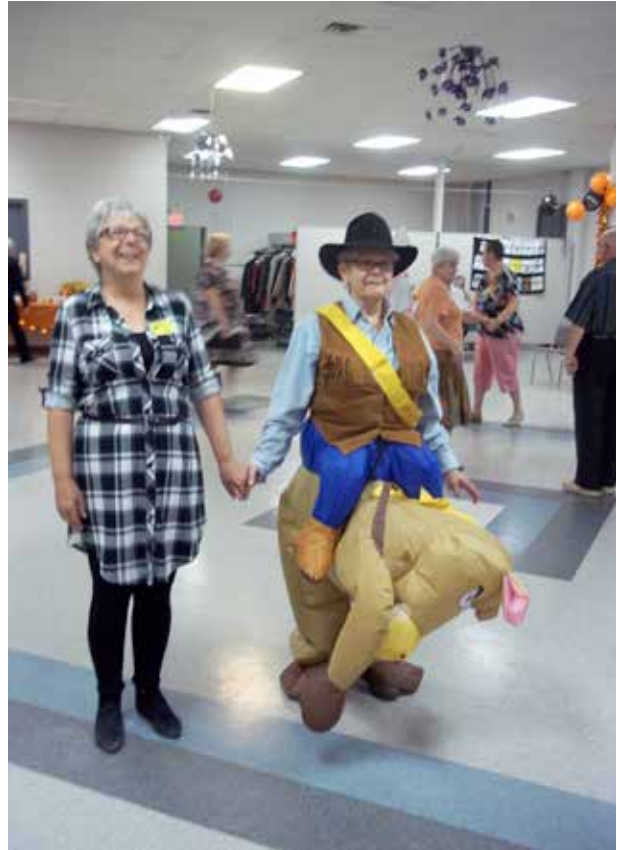
SOME CAME ON HORSEBACK