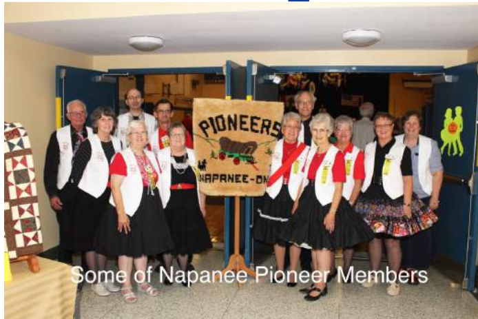
Some of Napanee Pioneer Members