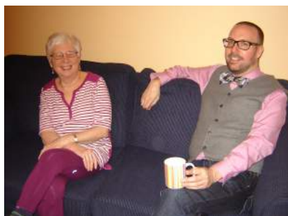
Sharing a joke between tips