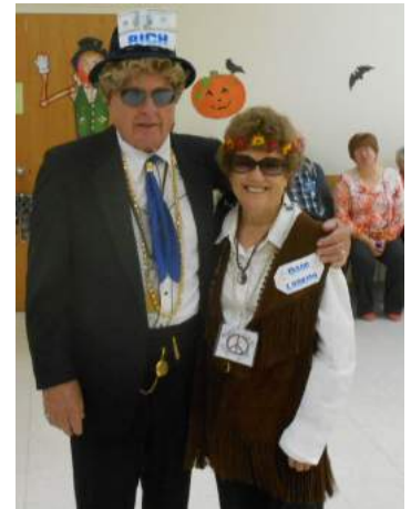
Rich & Good-looking