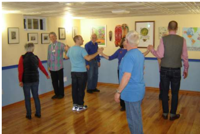
One of the last times dancing in the basement?