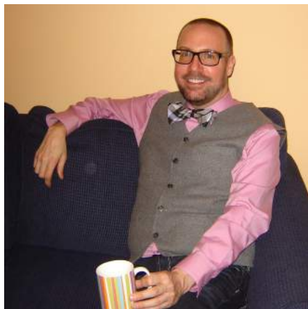
Meet the new boss!