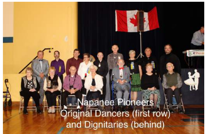
Napanee Pioneers Original Dancers (first row) and Dignitaries (behind)