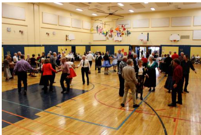
Some of the Date Squares were at the Napanee 50 th Anniversary Dance.