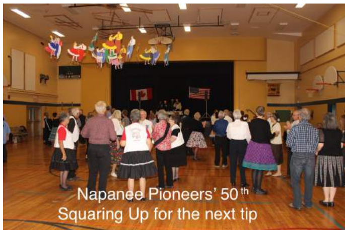
Napanee Pioneers' 50 th Squaring Up for the next tip